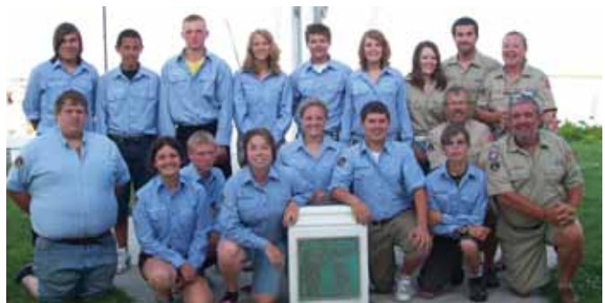
The Sea Scouts participating in their long cruise assemble for a group photo in Sheboygan.

working on it and hope that my next opportunity will more logically combine the underlying benefits with the obvious features.