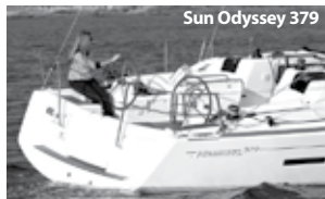
Sun Odyssey 379