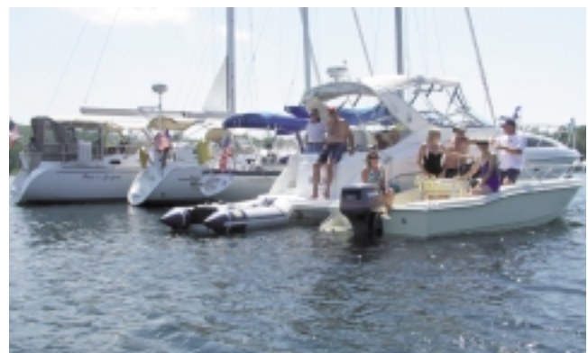
Top: A large contingent of the RYC cruising fleet gathers for a pot luck dinner in Fish Creek after the HOOK Rally.