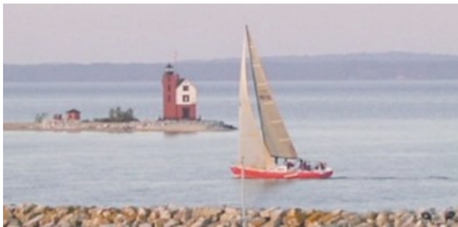
Nitemare crossing the finish line at Mackinac Island

Both Nitemares raced the Verve Cup. One of our crew, a lightning NA champ, took the 32 with his crew, the rest of us sailing the 70. Friday was mostly light air but with challenging shifts. The 70 came in at the end of the day in first, the 32 was mid-fleet. Saturday's race was a mid-distance (25 mile) with one course, starting in a great 15 kt. breeze. 170 boats started from one starting area and sailed several different length courses depending on their section. A real sight to see as short- and long-course boats converged on a common jibe mark. The wind went away by noon leaving the entire fleet to drift around the remainder of the course. With a little luck we finished by 3 pm and in second place. About 1/4 of the fleet couldn't finish.