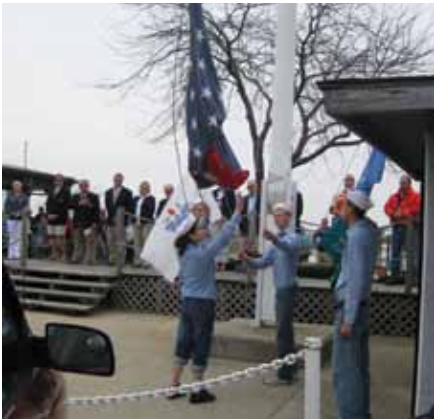
Sea Scouts respectfully hoist the colors on Opening Day.

breakfast to the typical attendance at the meetings we have for the racing participants. So, when a fellow sees stuff like that it just underscores this concept of