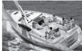
45DS with 360 Docking